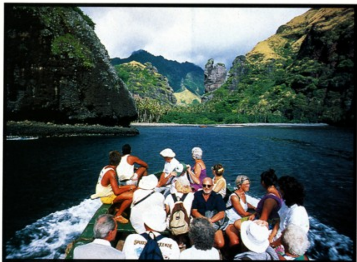
Above: Passengers from the Aranui travel up a mountain river.